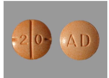
Shire 20mg Adderall mixed amphetamine salts

Shire sued for trade dress infringement, and Barr defended on the grounds that the design of Adderall was functional. The court agreed, and its discussion of the indicia of functionality is illuminating: