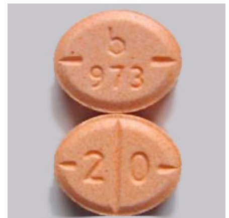
Barr 20mg mixed amphetamine salts

50. Shire US Inc. v. Barr Labs., Inc. , 329 F.3d 348 (3d Cir. 2003).