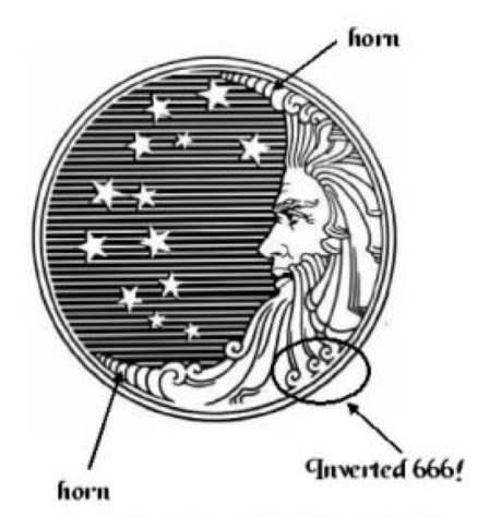
The devil's two horns and Antichrist's number 666

23. Procter & Gamble Co. v. Haugen, 222 F.3d 1262 (10th Cir. 2000).