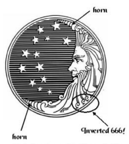
The devil's two horns and Antichrist's number 666

26. Procter & Gamble Co. v. Haugen, 222 F.3d 1262 (10th Cir. 2000).