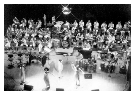
The Salsoul Orchestra