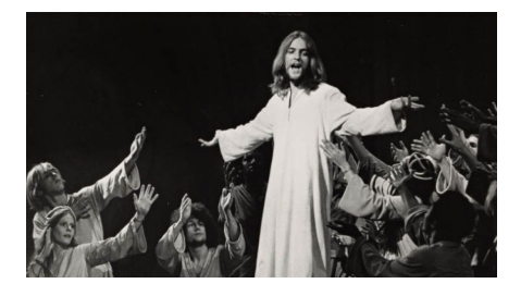
Jesus Christ Superstar (original Broadway production)

26. Robert Stigwood Grp., Ltd. v. Sperber, 457 F.2d 50 (2d Cir. 1972).