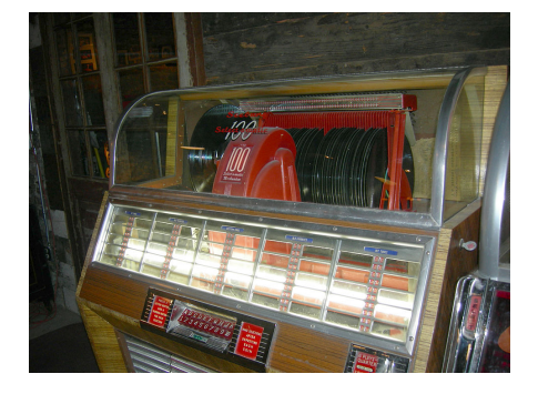
A jukebox. At the top are records; at the bottom are buttons to select which record to play. 28. 17 U.S.C. § 116.