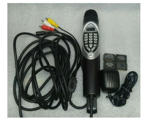
The Leadsinger device