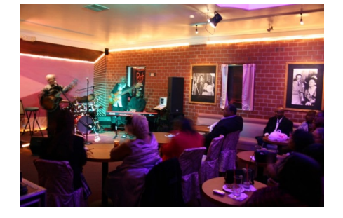
The Seabird [sic] Jazz Lounge

23. Broad. Music, Inc. v. Columbia Broad. Sys., Inc., 441 U.S. 1 (1979).