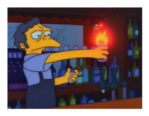
Moe Syzslak preparing a Flaming Moe