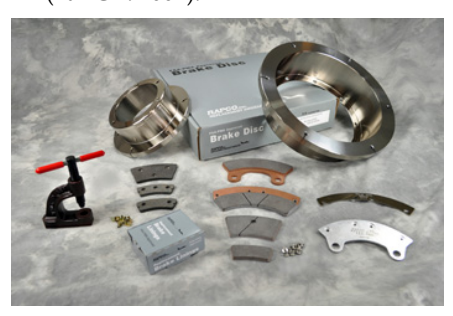
RAPCO brake components

12. United States v. Lange, 312 F.3d 263 (7th Cir. 2002).