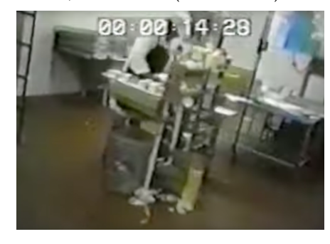
Hidden-camera footage from ABC's investigation of Food Lion